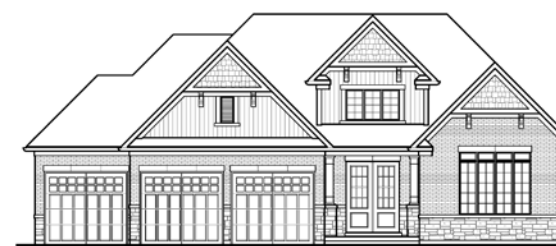
FRONT ELEVATION B