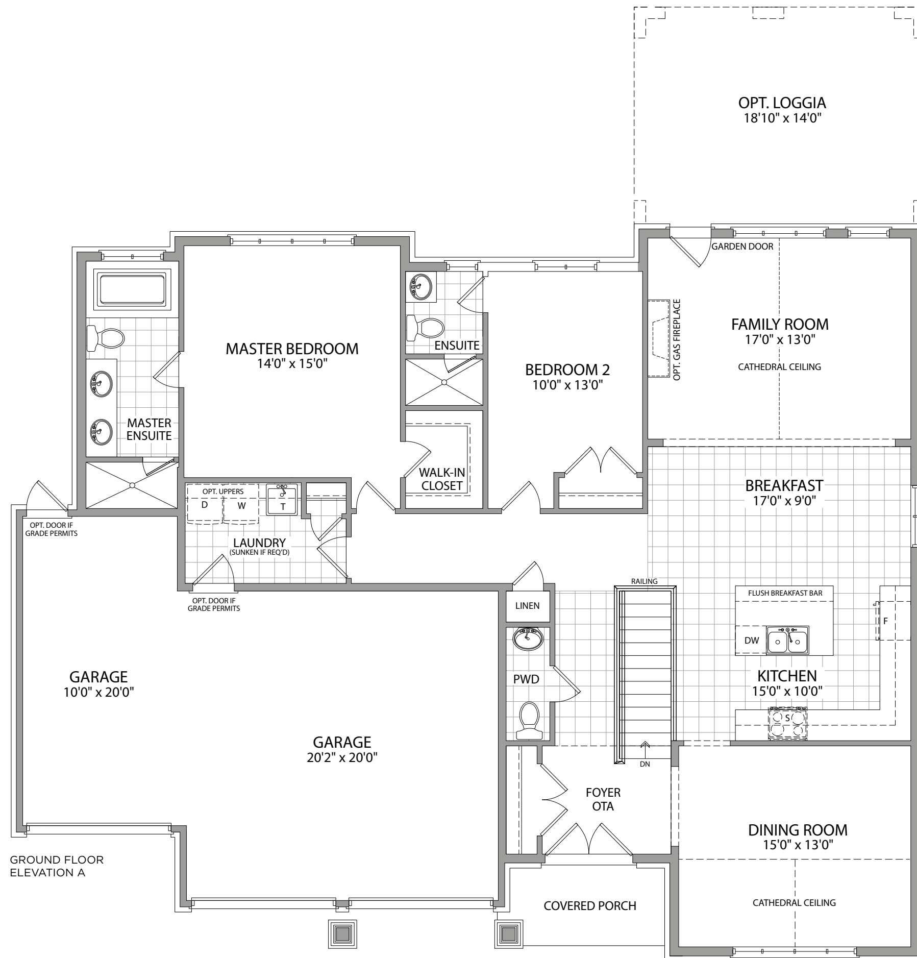
GROUND FLOOR ELEVATION A